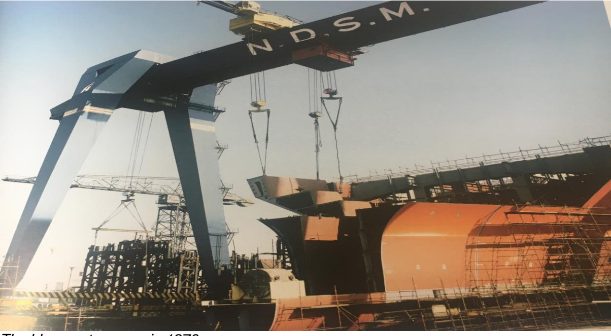
The blue gantry crane in 1976