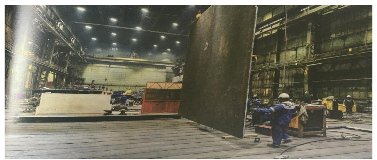
Steel workshop in Damen shipyard constructing new crane base 2017