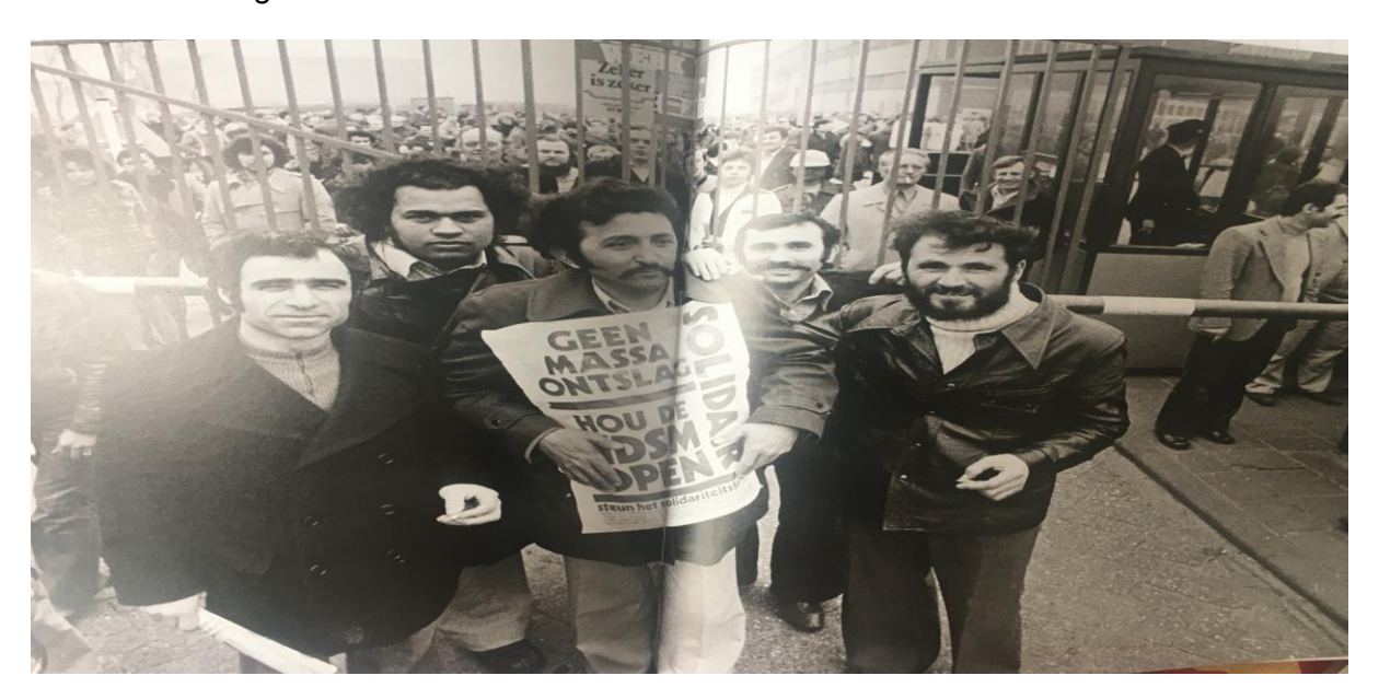
Protest over mooted NDSM closure in 1978

NDSM has always been a site which has been associated with times of political struggle and collective resistance. Shipbuilding as a whole has been a particularly strike-prone industry, and between its conception and 1995, the steelworkers of the NSM, NDM, and NDSM conducted strikes 61 times, more than any other Dutch organisation. (Van der Velden, 2017 and 2009) A strike of nail-boys lasted for two months in 1923, before a 10% pay cut led to further strikes (and layoffs) some months later (NDSM-Herleeft, Bloei). Later, during the German occupation during world war 2, just before the NSM and the NDM merged, members of the NSM engaged in passive resistance against German industrial production: "accidentally," machines broke down, equipment was messed up, fires broke out,' as