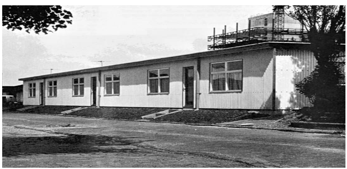
Former housing of Yugoslavian workers on the old Cornelius Douwesweg

Themes : Migration, contestation, diversity, integration, multidirectionality, destabilised narratives, nationalism, colonialism