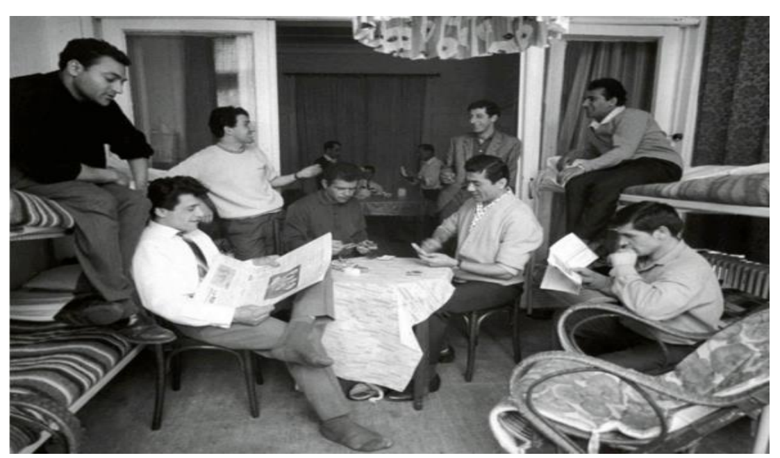
Life in Ataturk Turkish village in NDSM