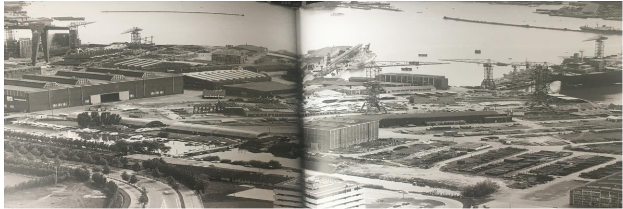
The NDSM in 1968