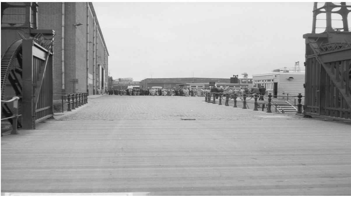
Protest over wages in 1968

Themes: contestation, instability, resistance, class-conflict, unity