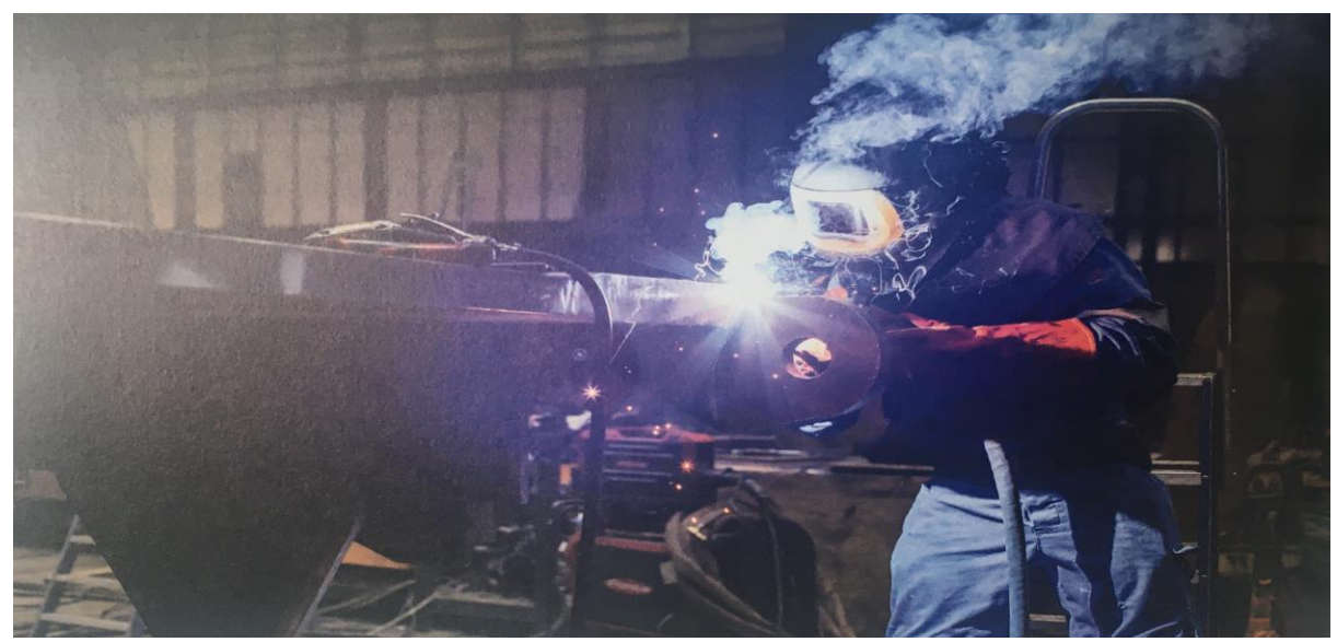
Welder constructing lifting lug in crane for crane-foundation

Working with ships often means working with metal, both in terms of materials and tools. Unlike smaller shipyards, large shipyards like the NDSM could also integrate suppliers of parts into their shipyards, meaning they didn't have to rely on imports for steelworks, boilers, machines, engines, welding equipment and so on. This allowed the NSM/NDSM to be one of the more innovative shipbuilding/repairing enterprises during the transition to steel ships at the turn of the 20th century, benefitting in particular from the invention of electric welding after world war II, making an all-welded cargo vessel in 1948. Dutch Company Werkspoor, associated with the NSM, also led the way for diesel engines for large ships. (Davids, 'Innovations', 219-222). The labour associated with working with metals and chemicals meant that you could smell 'fluid steel, welding fumes, paint, red lead, exhaust fumes, wet wood, heavy shag, sweat... rusty and bare steel, asbestos, grease and oil' on the site (Van der Sluis, interview, 2021).